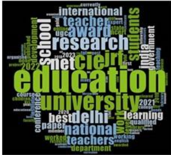
Present Occupation of CIE Alumni